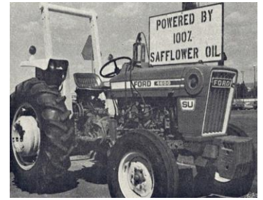
Early research on a tractor powered by 100% safflower oil

the Palouse in the area of Moscow, Idaho, but soon research partnerships grew to the Chemical Engineering Department. With this partnership, investigations began on transesterification, the chemical process