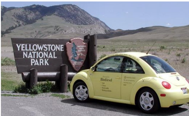
The University of Idaho introduced biodiesel into Yellowstone National Park in 1995. Influenced by Yellowstone’s success, all national parks now use biodiesel blends in their fleets.

The University of Idaho introduced biodiesel into Yellowstone National Park in 1995, which was the first national park to use biodiesel. A 4-wheel drive Dodge running on B100 made at the University was used to kick-off the “Truck-in-the-Park” project. Within a few years, the park decided to use B20 in all its vehicles. Influenced by Yellowstone’s success, all national parks now use biodiesel blends in their fleets.